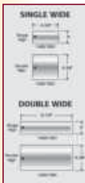
1400 - 1500 Series Door Sizes