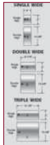
1600 - 1700 Series Door Sizes