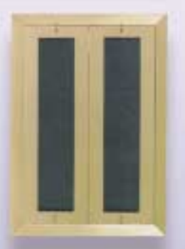
DV40, 6 1/2"W x 18 3/4"H DV80, 10 1/4"W x 18 3/4"H

Postal Service regulations require the installation of a tenant name directory in all multi-dwelling buildings having 15 or more mail receptacles. The separately mounted directory, either vertical or horizontal configuration, will accommodate 40 or 80 names which are embossed on 1/4" label tape (not included). Available in clear anodized finish, or silver/gold/bronze powder coating.