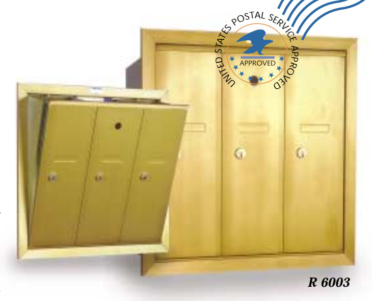
Security's vertical mailboxes are designed and constructed for trouble-free use and durability.